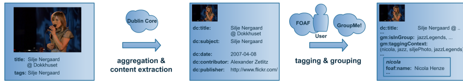
Fig. 4. Example: process of RDF content creation

Model. The core GroupMe! model is composed of four main concepts: User , Tag , Group and Resource . These concepts constitute the base for the GroupMe! folksonomy (cf. section 3). In addition, the model covers concepts concerning the users' arrangements of groups, etc. The Data Access layer cares about storing model objects.